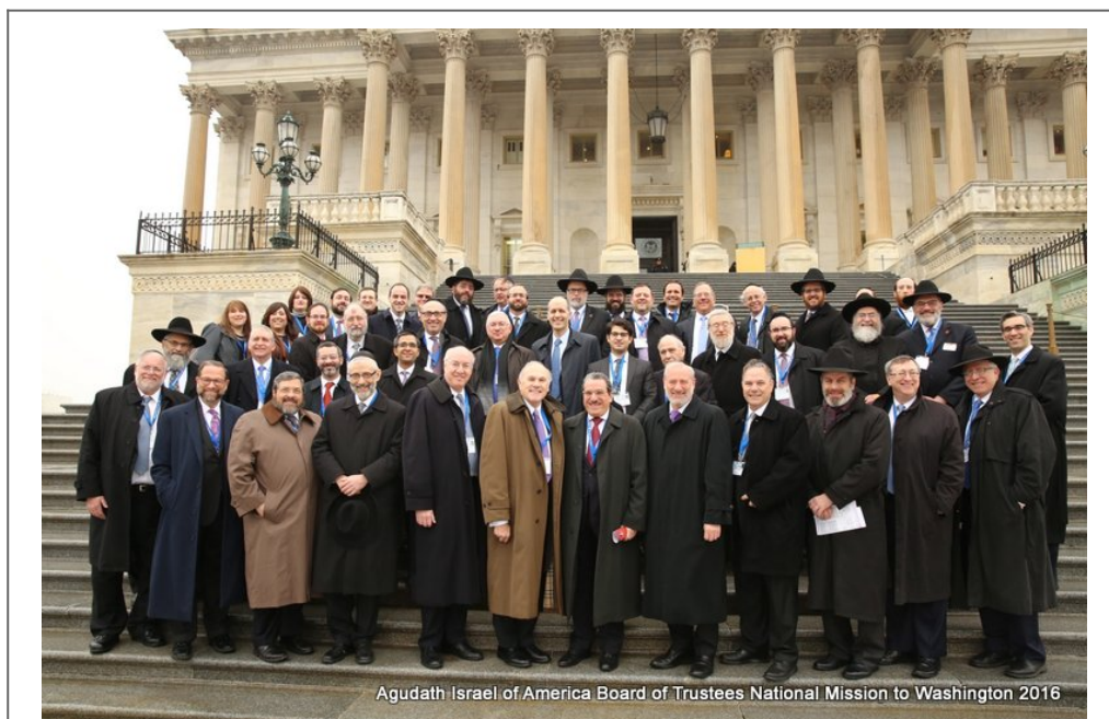
Mission delegates in front of the Capitol building