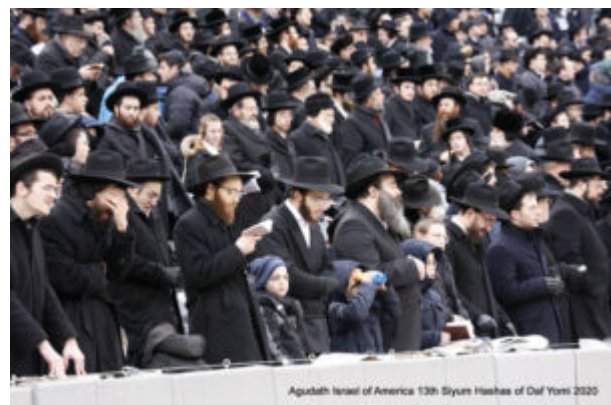
The 13th Global Siyum HaShas of Daf Yomi begins with Mincha, the afternoon prayer service.