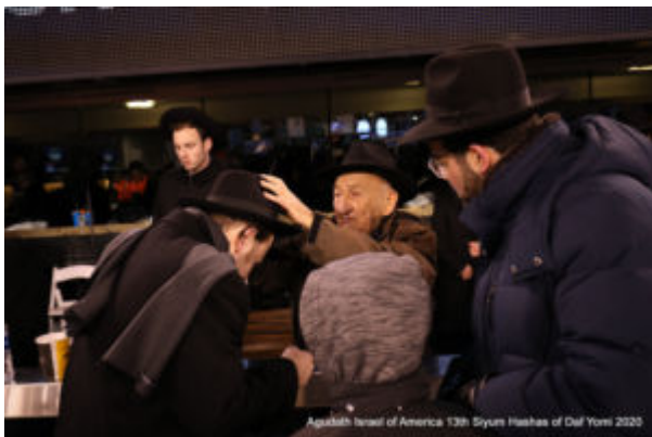
Holocaust Survivor Blesses Young Siyum Attendee