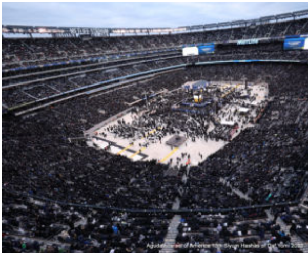
Crowd View of the 13th Siyum Hashas of Daf Yomi