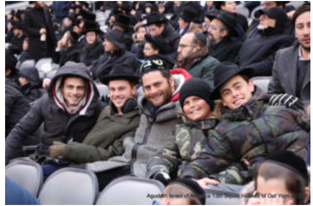
Partial View of the Crowd