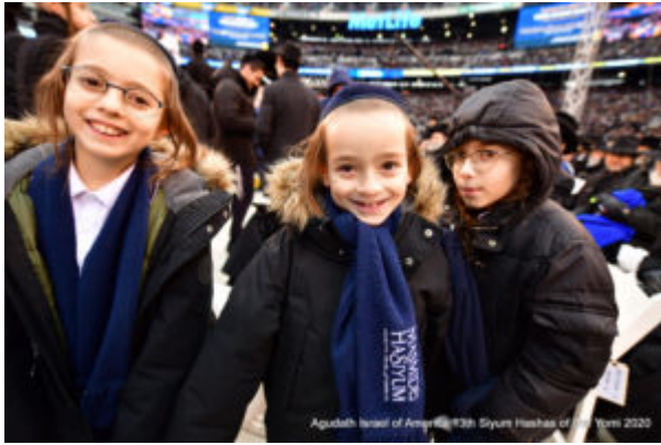
Young Participants in the Siyum Hashas Celebration