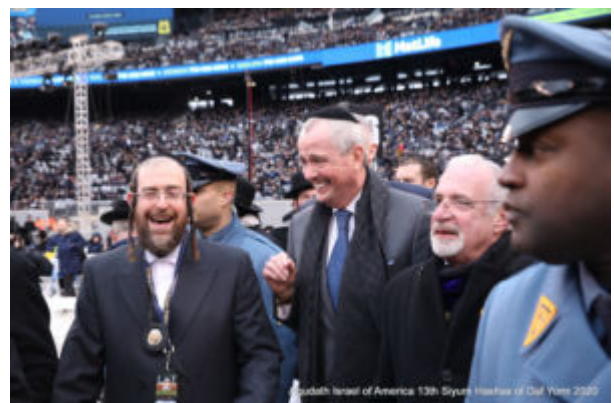
New Jersey Governor Phil Murphy at the Siyum