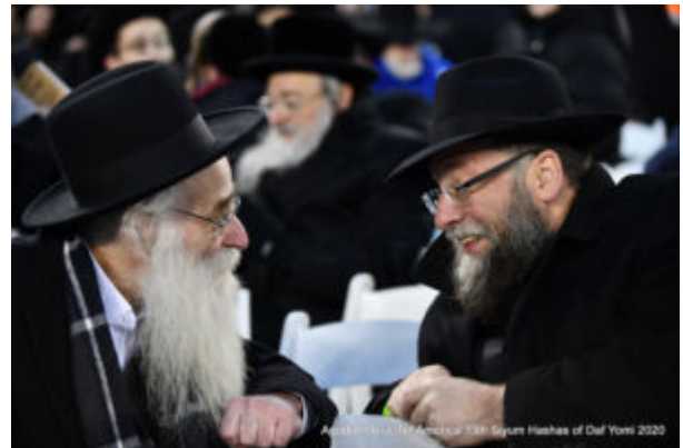
Attendees Conversing at the 13th Siyum Hashas of Daf Yomi