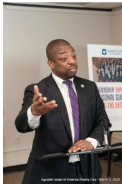
Senator Brian Benjamin